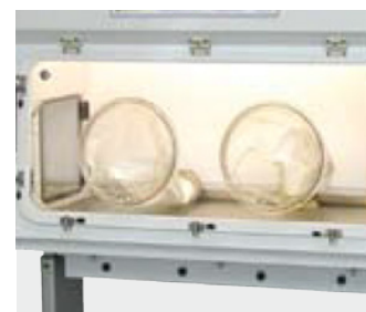
Two-glove and four-glove models